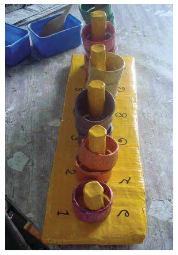
Bi-lingual education and physical dexterity can be learnt from this numbers board showing English & Bengali numbers. It was made from papier mâché in the paper project at CRP-Savar