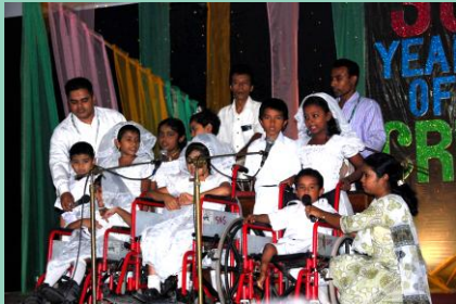
Children from the William & Mary Taylor Inclusive School, dressed in white, performed a traditional song.