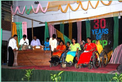
Patients from the CRP Women's Centre in Gonokbari also sung during the programme on Thursday.