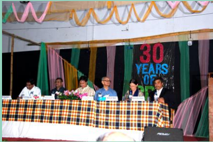
Chief Guests at the CRP 30 th Anniversary celebration.